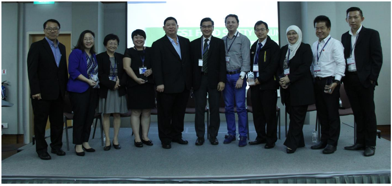
Ending the forum with smiles