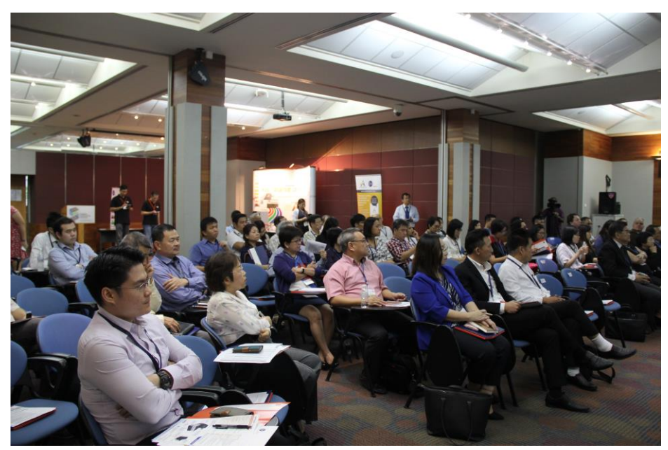
Participants at the GS1 Singapore Food Safety Forum held at the SMF House

This was the key takeaway for more than 80 participants who attended the GS1 Singapore Food Safety Forum 2016 held on 28 July at the SMF House. With the theme "Gaining Consumer Trust through Traceability in the Food Supply Chain", this forum, which was organised by GS1 Singapore, aimed to provide a platform for food industry professionals to learn insights from industry experts on different facets of traceability and food safety.